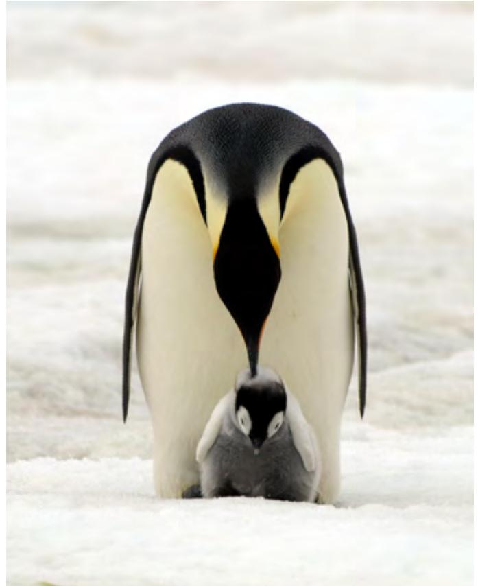
ABOVE: Emperor penguins face catastrophic breeding failure from loss of sea ice, as reported by BAS in August 2023. The Snow Hill colony is the most northerly colony of Emperor penguins, with the warmest average temperatures, therefore it is likely to be the most vulnerable to climate change.