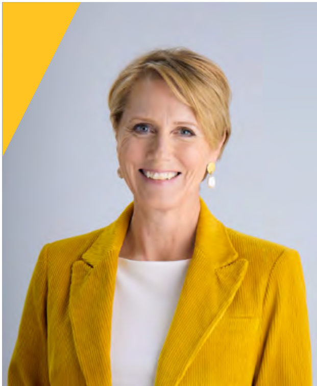
ABOVE: Independent Federal Member for Goldstein