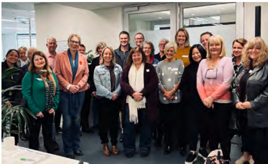
ABOVE: Morning tea at the Office of Zoe Daniel with Community Grant recipients and beneficiaries including Rotary Club of Brighton, BayCISS, Brighton Life Saving Club, Hampton Community Centre, Bayside Toy Library, and Bayside Community Emergency Relief.

Visit the Grant Guru website by scanning your camera on the QR code.