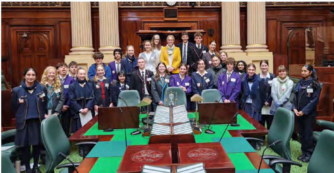
ABOVE: Year 10 Youth Parliament – hosted at Victorian State Parliament Legislative Assembly.