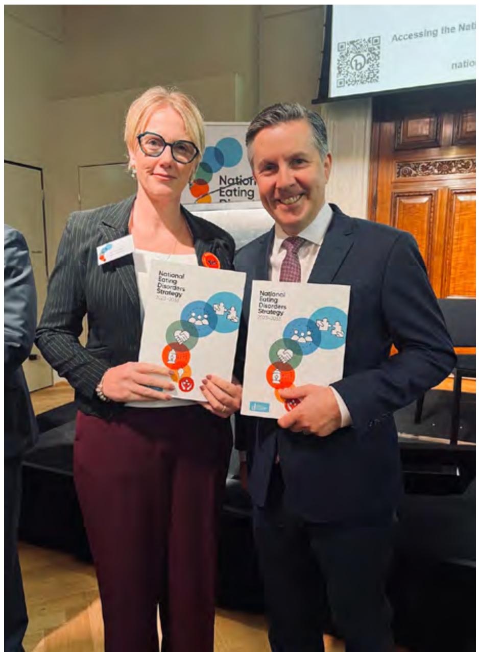
ABOVE: Zoe Daniel and Mark Butler MP, Minister for Health and Aged Care at the launch of the National Eating Disorders Strategy.